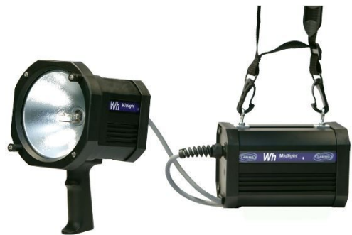
TLP - TrAc Light Pro