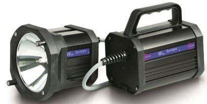
S135 - Duo with No Handle