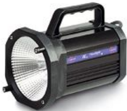
H135 - Compact with Top Handle H135TL - TrAc Light with Top Handle