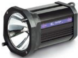
135 - Compact with No Handle 135TL - TrAc Light with No Handle