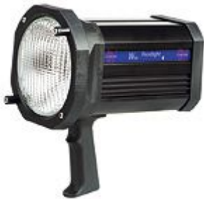
PH135 - Compact with Pistol Handle PH135TL - TrAc Light with Pistol Handle