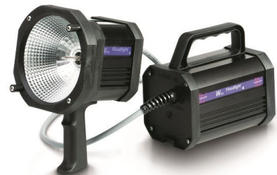
PS135 - Duo with Pistol Handle